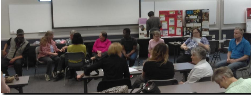
Barriers & Bridges Participants, Interpreters & CART

On May 23, DeafCAN! held a workshop in Delaware County for service providers, educators, and families to listen to and ask questions of a very diverse group of 10 Deaf individuals from the area who have faced many challenges and crossed many bridges.